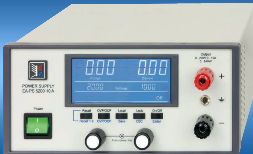
EA-PS 5200-10 A